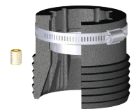
Mechanical Slip Kit